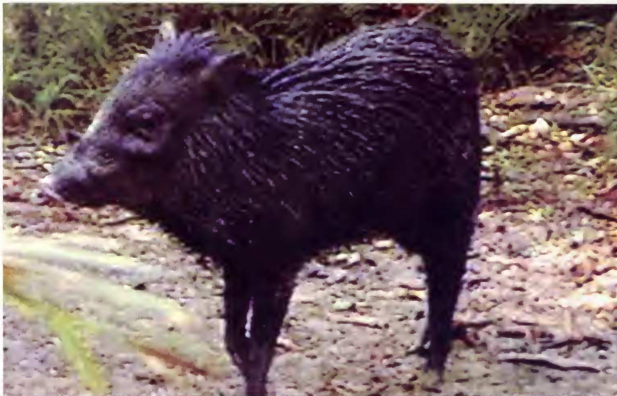
Fig. 4. Live Pecari maximus from the type locality.

trees Bertholletia excelsa . The upper canopy closes at the height of 30–40 m. The densest understory is associated with moist depressions along forest brooks.